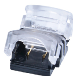
TAPE-TO-TAPE GRIPPER CONNECTOR