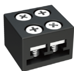
TAPE-TO-TAPE BLOCK CONNECTOR