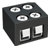
TAPE-TO-WIRE BLOCK CONNECTOR