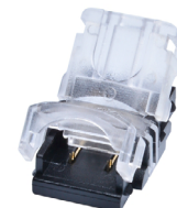
TAPE-TO-WIRE GRIPPER CONNECTOR